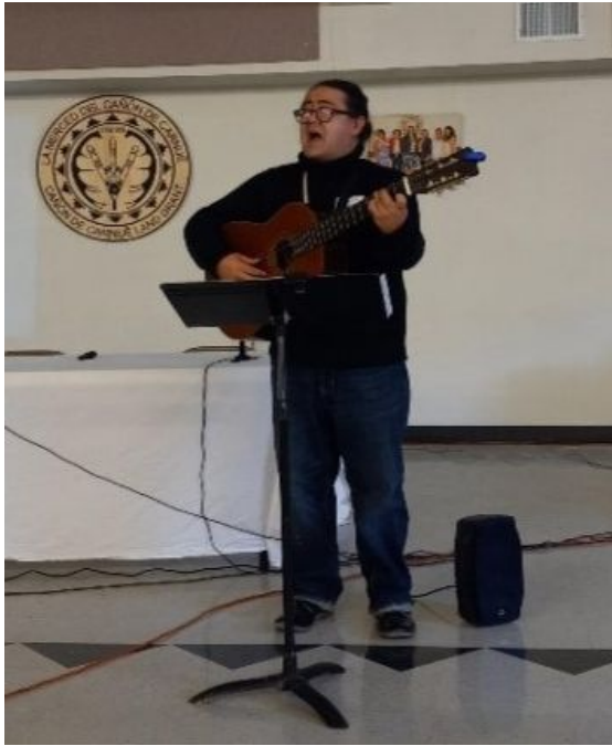
The CLE included a performance of historic Spanish corridos related to land grants and acequias.