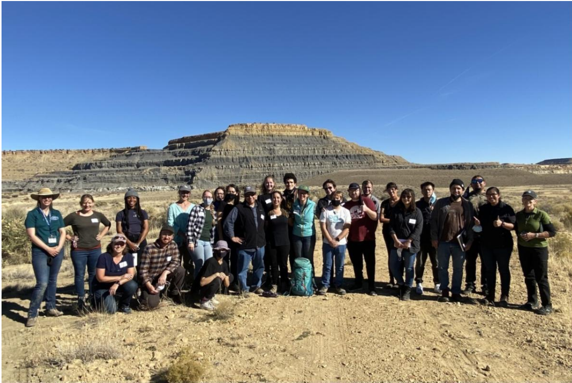
UNM students visited a Superfund site to learn about uranium mining impacts on Laguna Pueblo.